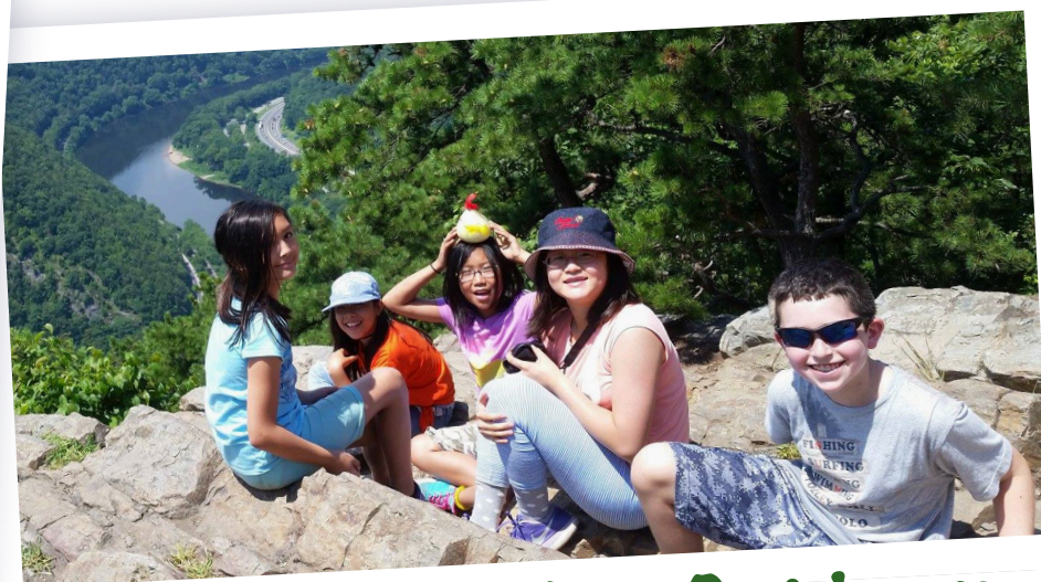
50 Years of Kids Outdoors