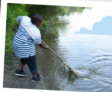
50 Years of Muckracking & Stream Ecology