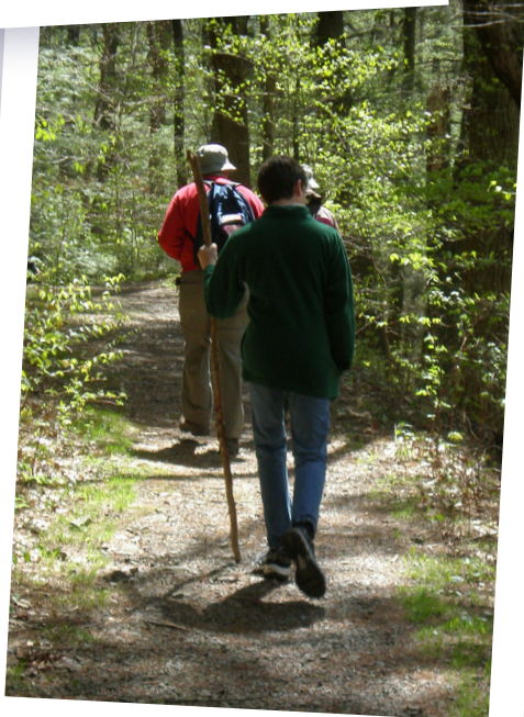
50 Years of Hiking