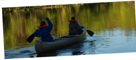
50 Years of Canoeing