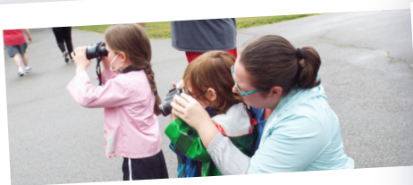
50 Years of Birdwatching